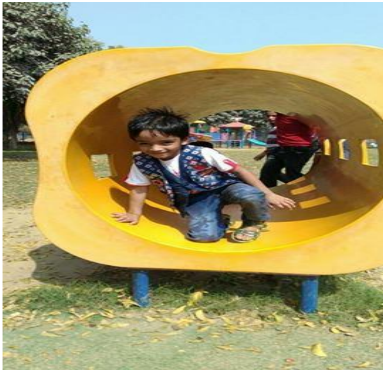
“The best is yet to plan”