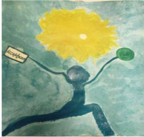
Udai – working together works